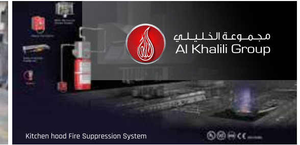
Kitchen hood Fire Suppression System