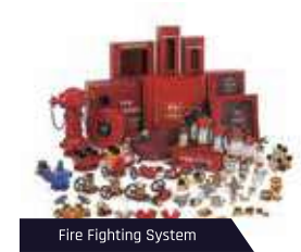
Fire Fighting System